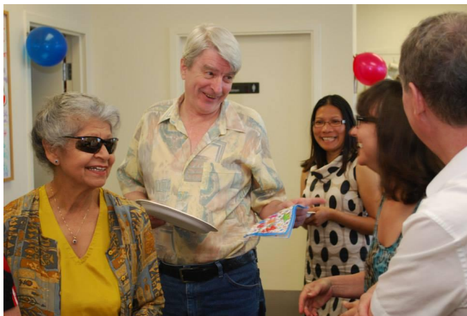
We held our yearly VBC Membership Appreciation Open Pairs Party on July 27th.

For complete photo coverage of our many festive events, please see our VBC People page or visit our page on Facebook .